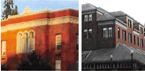
Building Meets the Sky - Complex rooflines draw your eye upwards.