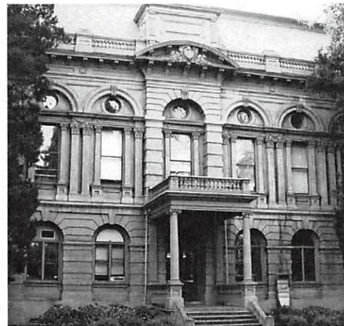
Villard Hall (National Landmark)