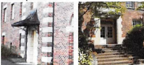
Secondary Entrances - These are not as bold as a main entrance, but still easy to locate and with visual interest.