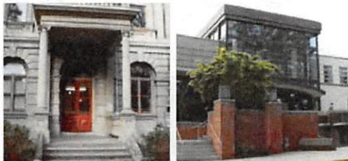
Main Building Entrance - Provide a clear sense of where to go, how to enter the building; a feeling of arrival, building presence, and weather protection.