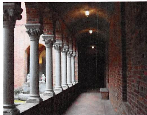
Jordan Schnitzer Museum of Art (National Register)