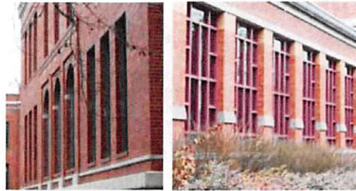
Rhythm of Windows - Repetition of windows break up the scale of the facade (e.g., openings separated by columns or other vertical elements or recessed windows). As a general (but not absolute) rule, avoid large, blank facades, large areas of glazing, or unbroken, horizontally oriented windows (ribbon windows).