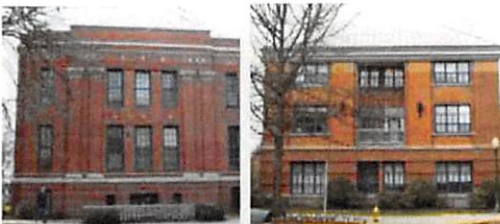
Composition - Buildings should be vertically composed of three parts: top, middle, and bottom. Provide distinction through the use of horizontal lines, such as banding, use of different materials, or variation in patterns and textures.