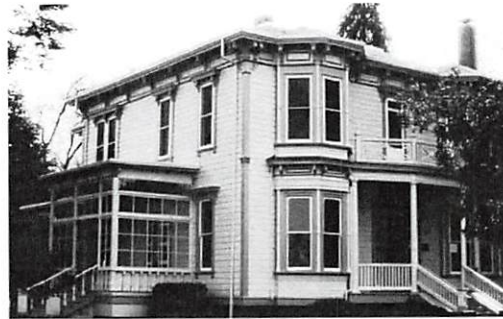
Collier House (City Landmark)