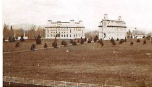
Deady Hall Walk Axis, circa 1896 (National Landmark)