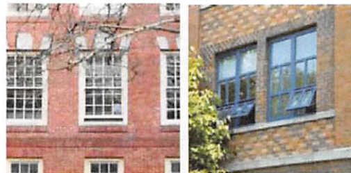
Operable Windows and Window Details - Allow fresh air and the ability to adjust personal environment. Window details can include change in material with banding, brick patterns, type and color of frame.