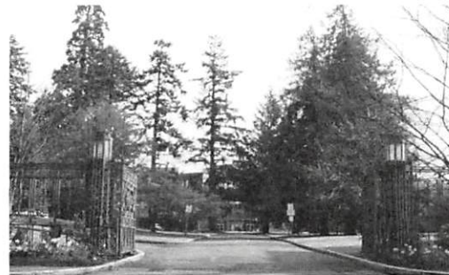
Dads' Gates (National Register)